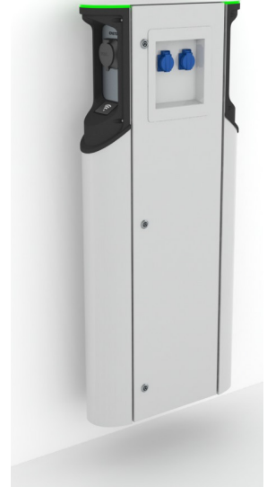
EVF200 Dual charging station for wall mounting