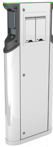
EVF200 Dual charging station for ground mounting